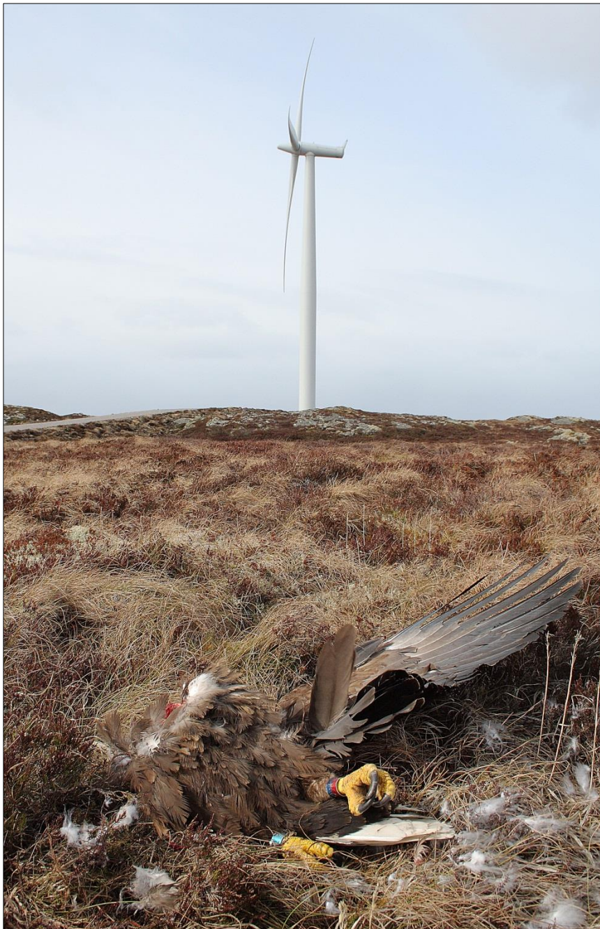
NOF-BirdLife Norway calls for improved requirements for environmental impact assessments associated with establishment of new windfarms and power lines. By January 2014, a total of 54 white-tailed eagles have been documented killed at the windfarm at Smøla, Møre og Romsdal alone.