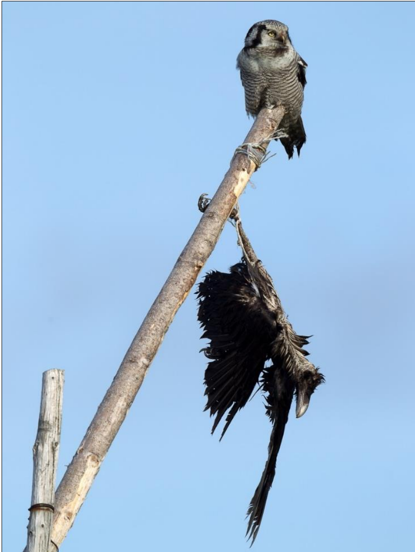
Northern hawk owl at Røst archipelago, Nordland, during irruption in autumn 2013. Investigations of regional movements are needed to better estimate the Fennoscandian population of this species.

European population. A wide selection of tracking devices is currently available or under development that could help provide such data. Information on population dynamics and distribution according to prey abundance and variations in climate are also needed to predict future prospects.