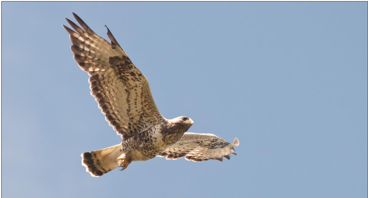
Male rough-legged buzzard at nesting site in Finnmark, northern Norway. The Scandinavian population size is probably decreasing, but data is lacking in Norway.

As nests may be built in cliffs in forest areas, and sometimes in trees, forestry may pose a threat. Nests are usually used repeatedly. The threat can be reduced if nests are located and protected prior to such activities. Søgne (2011) suggested the following: Avoid forestry within a distance of 50 m from the nest. If nests are located on large cliffs, forestry should be avoided within a distance of 50 m to each side and 25 m from the foot of the cliff. In addition there should be no disturbance within a distance of 200 m from the nest during the breeding season (March-August). Within these limits, there should be no forestry operation less than five years after the last breeding record. NOF-BirdLife Norway considers this as minimum measures.