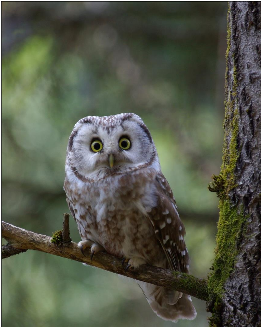
Adult female boreal owl at nesting site in Nord-Trøndelag. Research on movements outside the breeding season would help in the establishment of a Fennoscandian population estimate.

A long-term data set on small mammal cycles and boreal owl dynamics from north Norway was analysed and compared with related Fennoscandian studies by Strann et al. (2002). A significant positive correlation was found between number of breeding boreal owls and the abundance of Clethrionomys spp. (grey-sided vole and red vole) the following autumn, but not for shrew abundance. Number of fledged chicks and clutch size was also dependent on Clethrionomys spp. abundance. No significant correlation between number of breeding boreal owls and Clethrionomys spp. abundance the previous autumn was found. This may indicate that high autumn densities of small rodents always lead to a collapse the following winter, and low densities the following spring. This contrasts to the situation reported elsewhere. The three-year cycles reported from the Norwegian study also contrast to the 4-5 year cycles reported from Finland at the same latitude (Hansen et al. 1999). From this, the authors argue that dynamics may be different over short distances, and may be correlated with continentality, as well as latitude. It is also stressed that “cyclic dynamics with large amplitude still persist at least locally in Fennoscandia”, despite less cyclicity observed elsewhere, and that “the gradient cyclicity and cycle period cannot be simply interpreted as a latitudinal gradient”, as previously suggested (Strann et al. 2002).