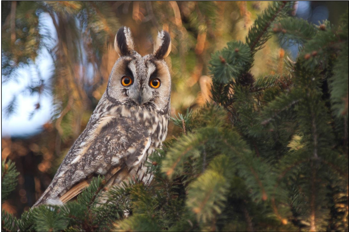
Long-eared owl at daytime roost in winter. Satellite tracking would be beneficial to track nomadic movements of Norwegian long-eared owls.

sample size is small. Numbers from Lista are too small to analyse (Ranke et al. 2011, Wold et al. 2012).