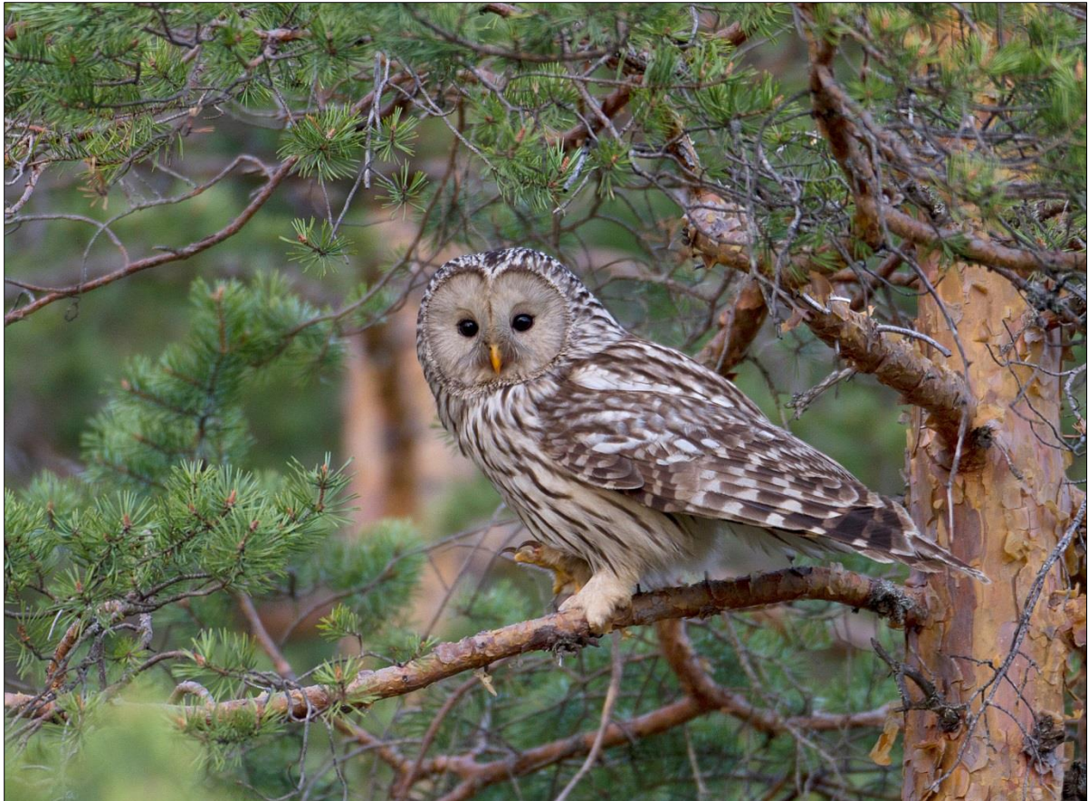
Ural owl at breeding site in Hedmark. More than 450 nestboxes have been erected for the species in the border areas between Hedmark in Norway, and Värmland and Dalarne in Sweden. Ten pairs bred in Hedmark in 2013.