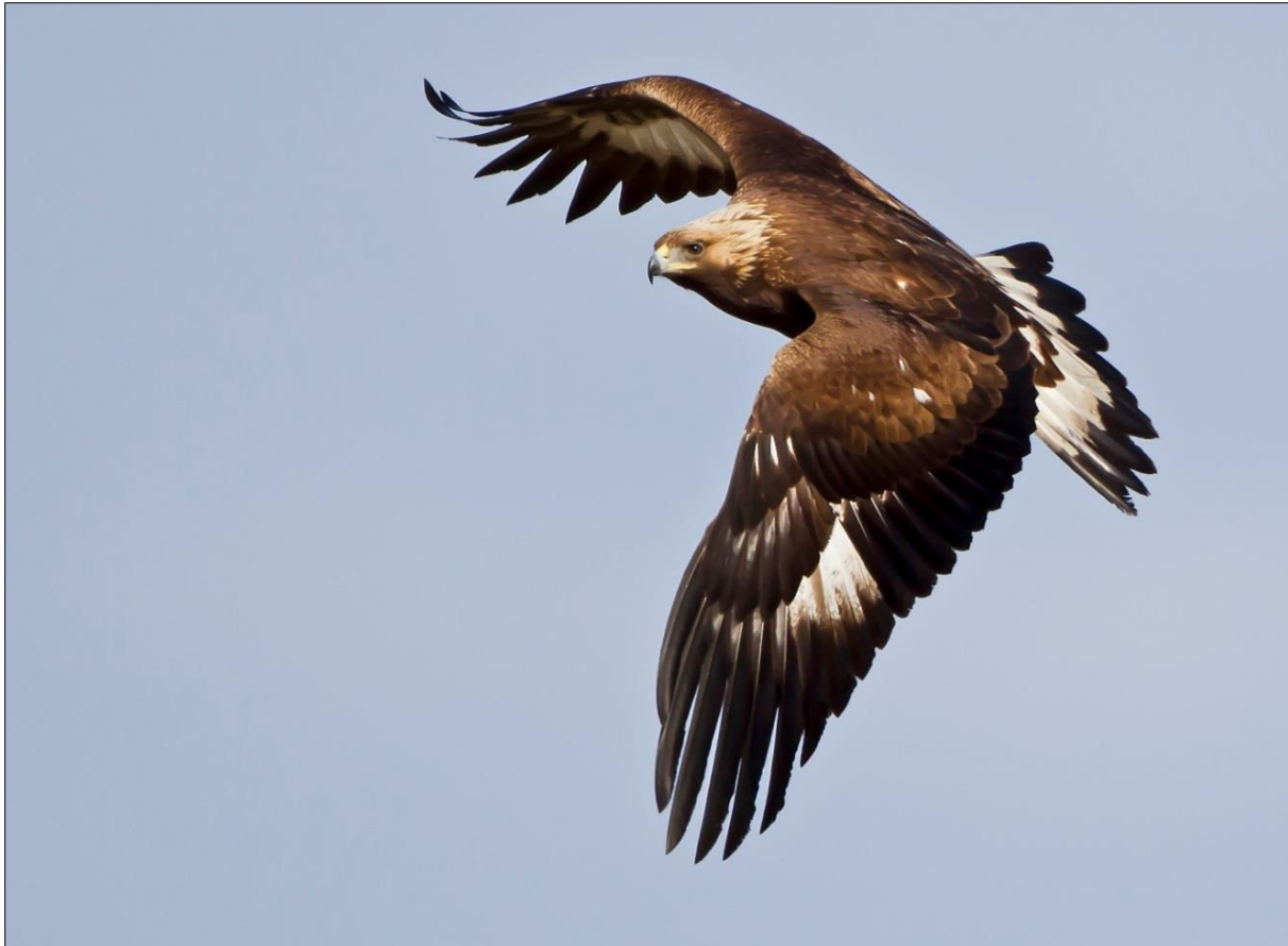
Young (2cy) golden eagle, southern Sweden. The Norwegian population size is slowly increasing. NOF-BirdLife Norway calls for improvements in the compensation scheme for golden eagle depredation on sheep and reindeer.