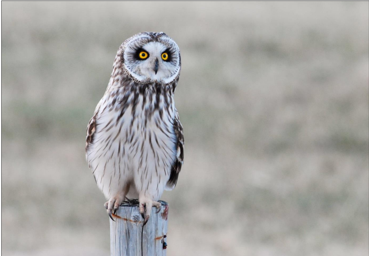
Short-eared owl in Finnmark, northern Norway. Tracking data would be beneficial to map nomadic movements of this species, and to establish more accurate estimates of the Fennoscandian population size.

The Norwegian population was suggested to number 1 000-10 000 breeding pairs in the period 1990-2003, and fluctuates according to rodent populations (BirdLife International 2004). The same population estimate was published in Gjershaug et al. (1994). However, there is little quantitative data to support this, and the upper limit of this estimate is likely to be too high. This is supported by a smaller Swedish population, estimated to 1 700 pairs in 2012, with an interval of 755-4 702 pairs. The Swedish population has declined during the past 30 years (Ottosson et al. 2012). The species can be found breeding in most parts of Norway, but is generally most numerous in mountain areas in the northern and middle parts of the country. Short-eared owls are rarely found breeding in Hordaland, Oslo & Akershus, Østfold and Vestfold (Sonerud 1994c).