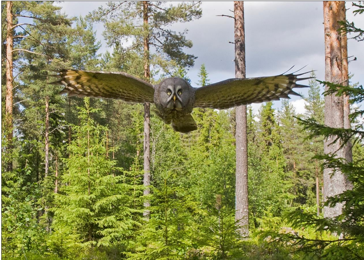
Female great grey owl attacking at nest in Hedmark when owlets are ringed. Protecting raptor nests and erection of artificial nests would help the species establish in Norway.