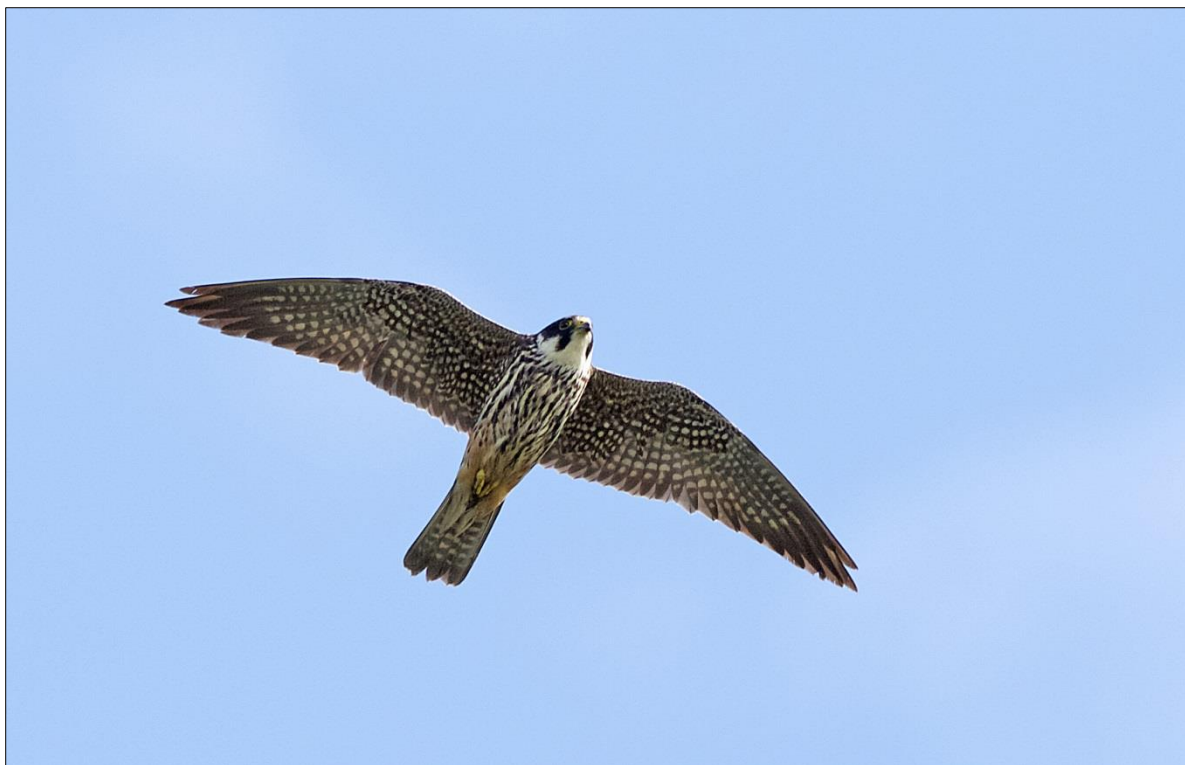
Adult Eurasian hobby in Stokke, Vestfold in June 2012. Investigations of the population size of this red listed species in southern parts of Norway have revealed a larger population in the area than what was previously expected.