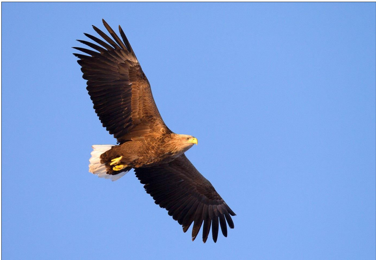
Adult white-tailed eagle in Finnmark, northern Norway. The Norwegian population of this species is by far the biggest in Europe.

Wind turbines have been shown to pose a threat to Norwegian white-tailed eagles. To avoid mortality of eagles caused by wind turbines, it is important to carry out proper environmental impact assessments before building of windfarms, to avoid the most important breeding areas, feeding areas and roosting areas. Temporary down of wind turbines at sites where eagles are especially vulnerable during certain periods of the year should be considered.