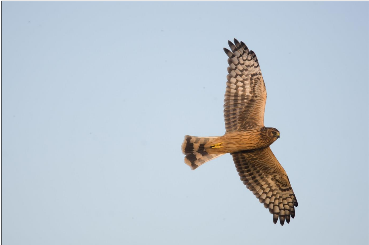
Juvenile hen harrier. The breeding population in Norway fluctuates with prey abundance, and population size is therefore difficult to estimate. More investigations are needed, especially in the north, to establish a more accurate population estimate.