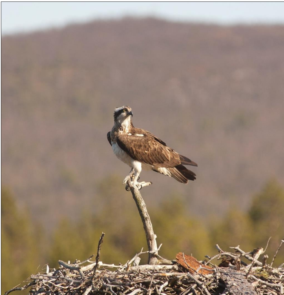
Osprey at nesting site in Finnmark. As in many other parts of Europe, the Norwegian population size is increasing.