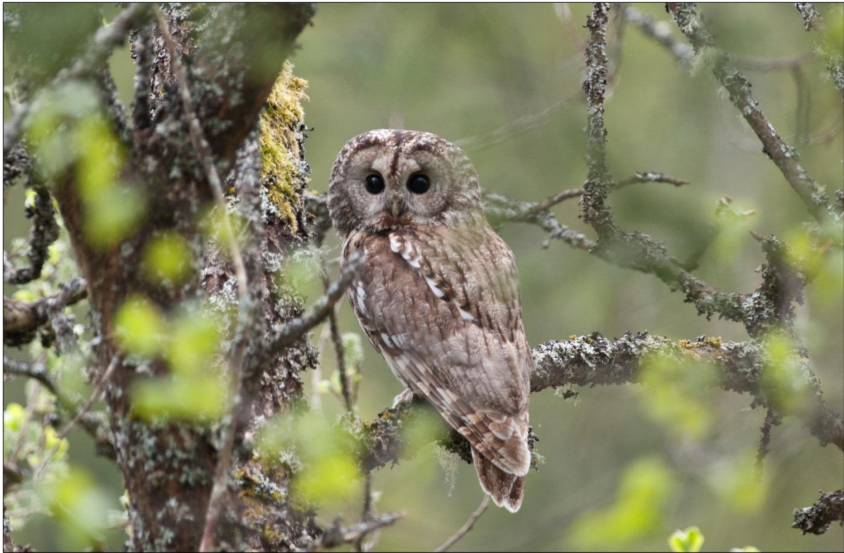
Female tawny owl at nesting site in Nord-Trøndelag. By 2013, more than 350 nestboxes have been erected for the species in the Trøndelag counties.

the nestbox. Even if both parents are presumed to be important for successful rearing of chicks in this species, the widowed males successfully reared the broods of respectively two and three owlets (Overskaug & Øien 2002).