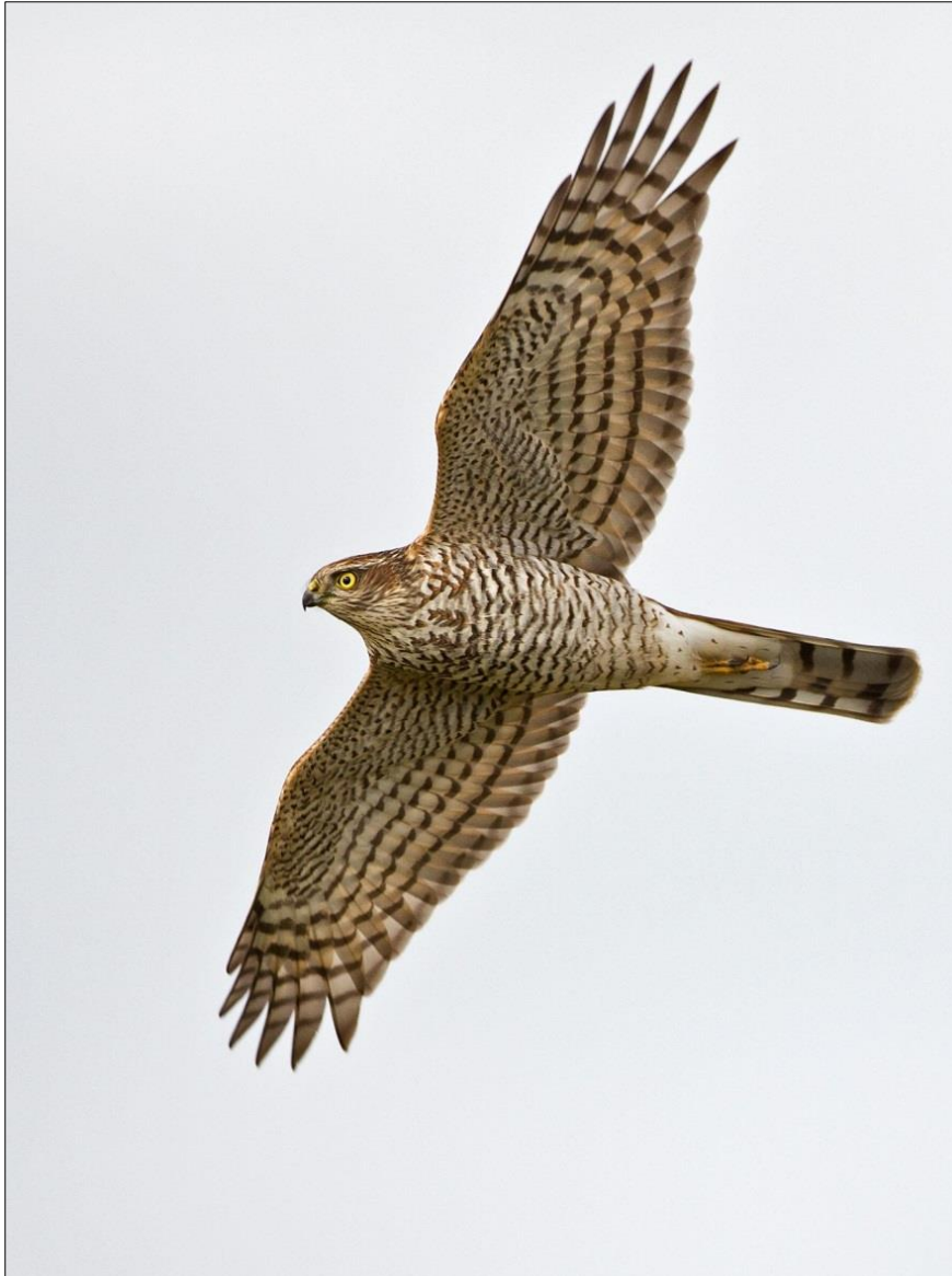
Eurasian sparrowhawk on migration at Falsterbo, southern Sweden. The sparrowhawk is one of the most common birds of prey species in Norway, and the population is probably increasing.