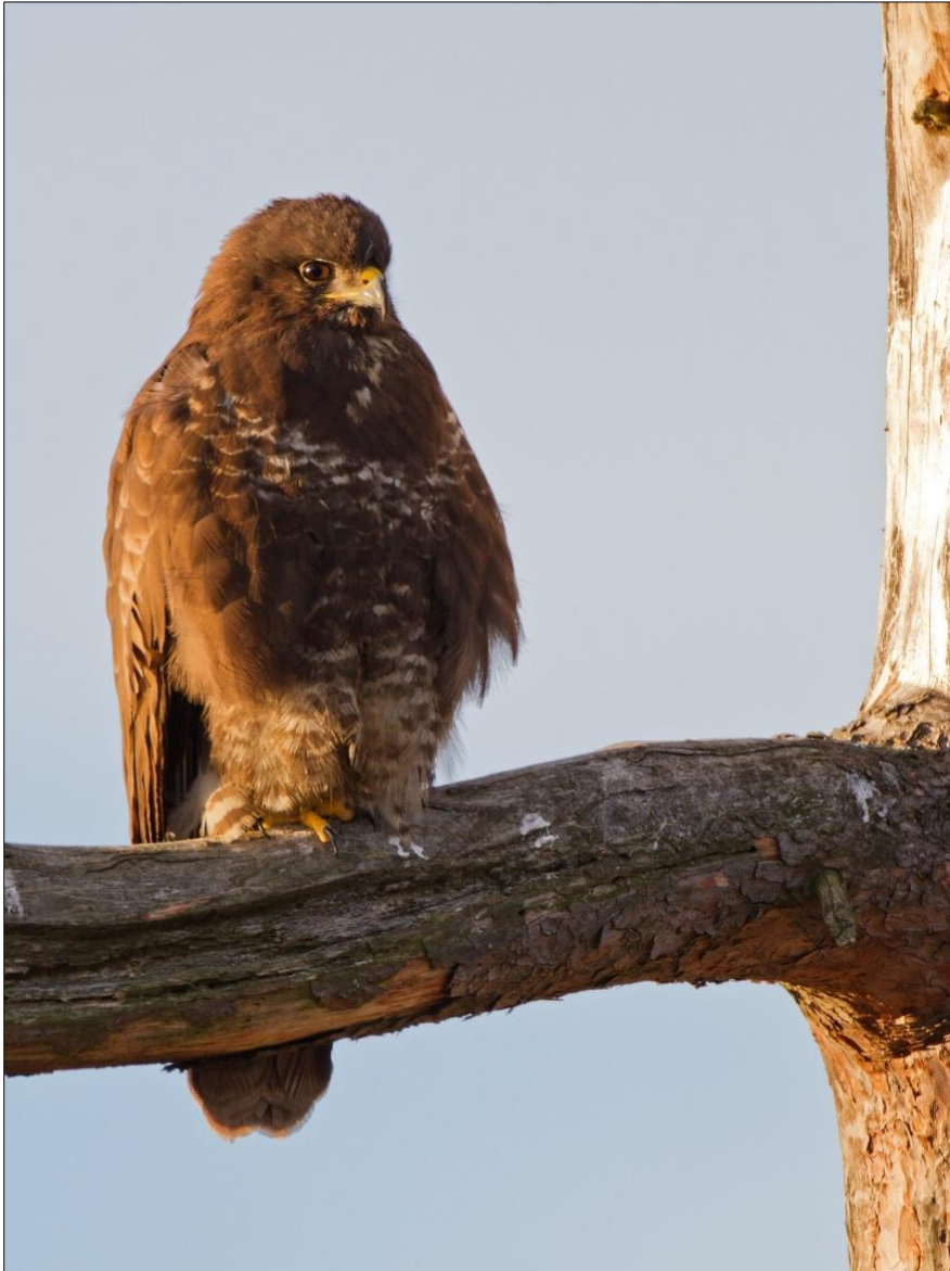
Common buzzard, southern Sweden. Most Norwegian common buzzards breed in the southern and eastern parts of the country.