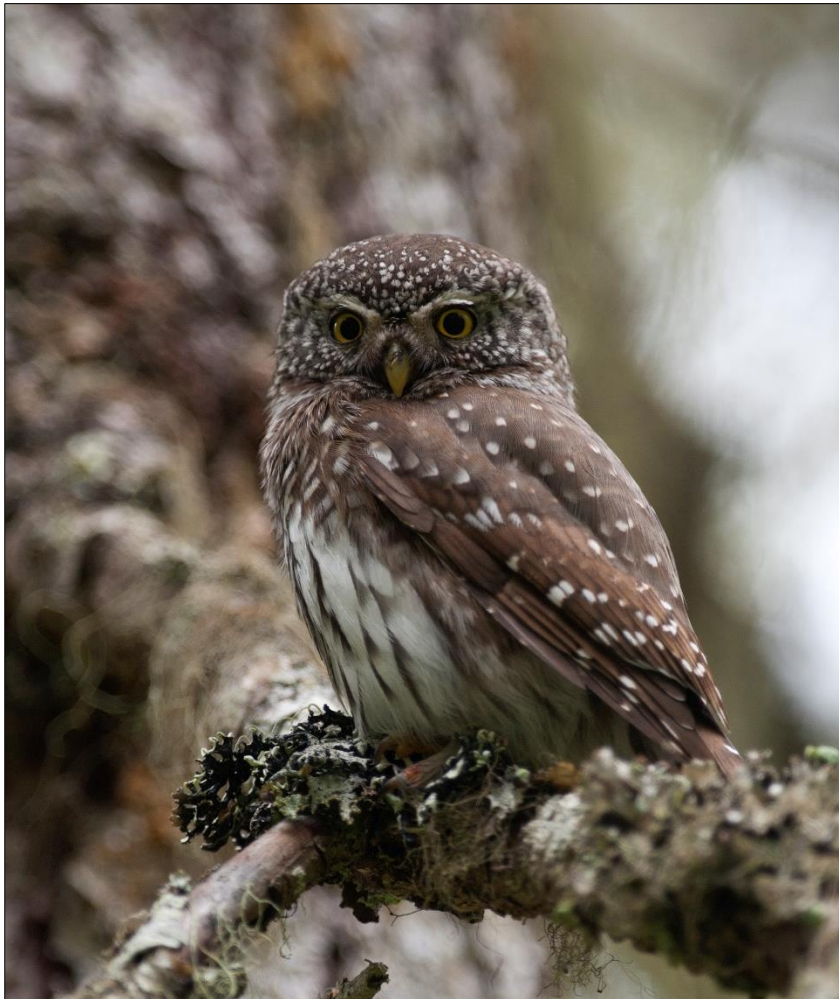
Adult male pygmy owl near nest site in Nord-Trøndelag mid-Norway. The species' hoarding habits have been investigated both in Hedmark and Trøndelag.

January-September 1993, when small mammal populations were in their low phase. Minimum convex polygon home range size ranged 0.4-6.0 km 2 , with a median of 2.3 km 2 . The habitat composition in the pygmy owls' home ranges differed from that in the study area. Mature forest ranked highest, followed by young thinning stands, edge between forest and open areas, clear-cut areas, advanced thinning stands and finally agricultural crop land where the pygmy owls were never observed (Strøm & Sonerud 2001).