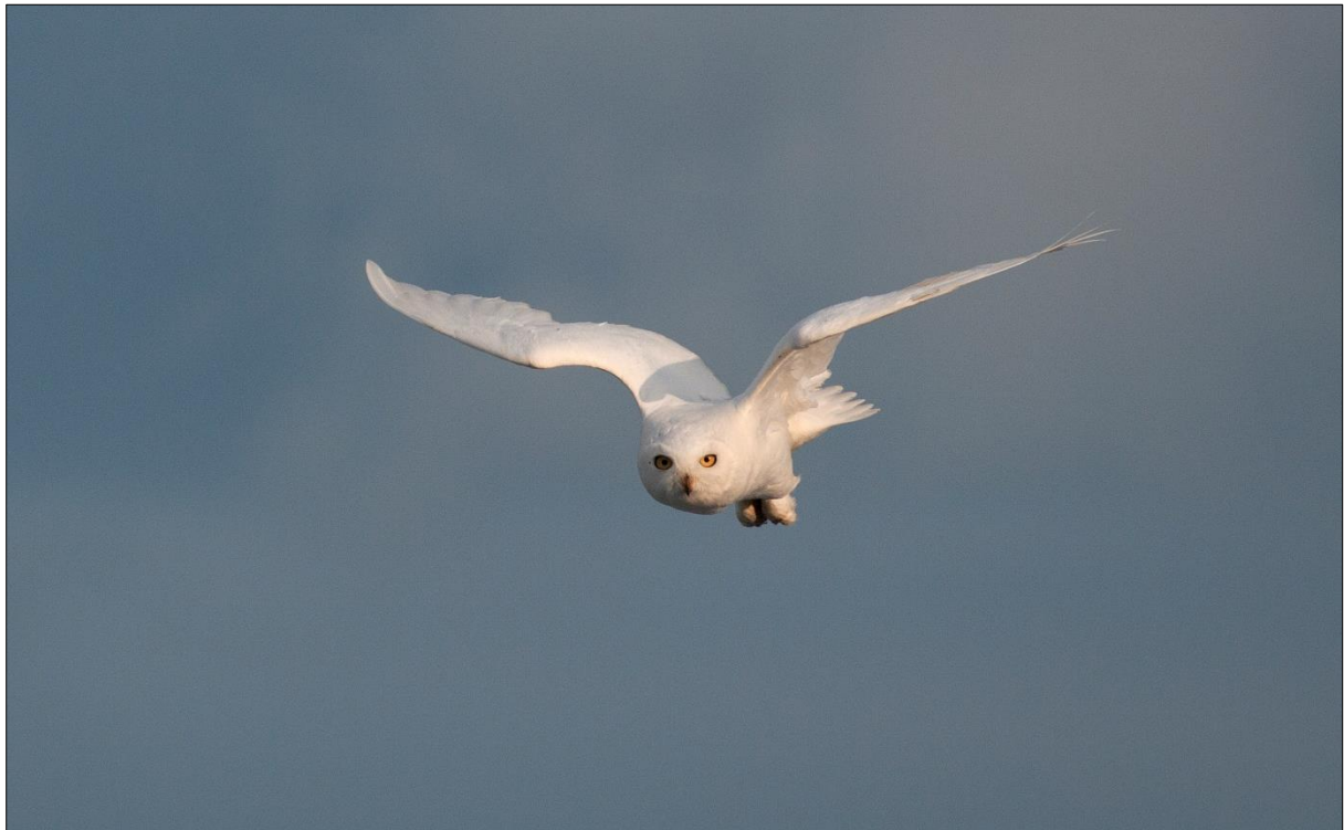
Male snowy owl at breeding site in Finnmark. The Norwegian population is shared with Sweden, Finland and Russia.

One relevant measure in this concern is to continue the Norwegian snowy owl project to help reveal more about migration and movements, levels of contaminants, winter diet and annual occurrence in Norway and neighbouring countries. Ongoing studies on the movements of snowy owls by satellite tracking should be given priority in order to increase the knowledge on how snowy owls distribute between Russia, Finland, Sweden and Norway throughout several rodent cycles. It is important to establish better collaboration with environmental managers and researchers in Sweden and Finland, in addition to maintaining contact with Russian researchers and environmental managers. It will also be relevant to introduce site protection under the Nature Diversity Act in some areas, as breeding locations often are smaller, limited areas that are used over and over again when conditions are favourable (Jacobsen et al. 2014).