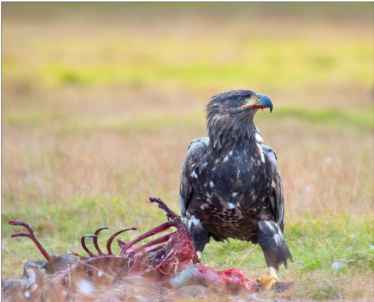
Young white-tailed eagle on a reindeer carcass in Finnmark. The conflict between golden- and white-tailed eagles and farmers/reindeer husbandry is difficult to avoid. Golden eagles occasionally kill livestock or reindeer, and the conflict becomes an economic issue. In Norway, it is most exceptional that white-tailed eagles attack or kill reindeer or other livestock.

In addition, it is important to make people aware of the value of having birds of prey around, in predicting the state of their environment and controlling prey populations.