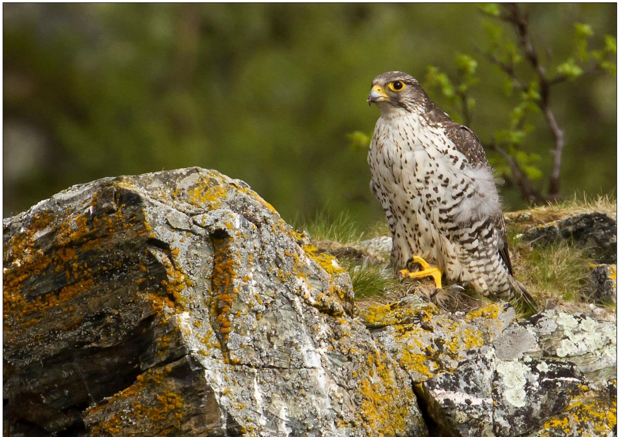
Gyrfalcon at breeding site in Finnmark, northern Norway. Reducing harvest of grouse from 30% to 15% of August populations would be beneficial for the species.