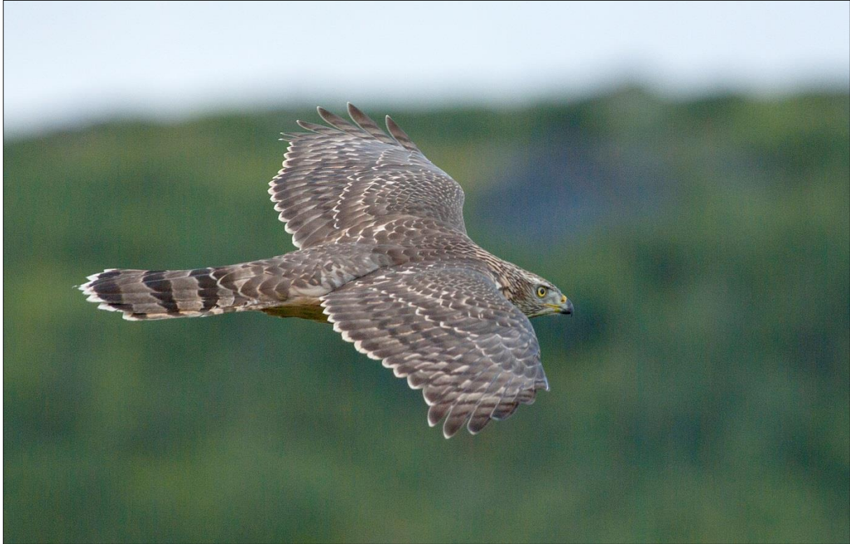
Juvenile northern goshawk. This is one of few birds of prey species with obvious population declines in Norway during the last two decades. The decline is mainly due to modern forestry.

Persecution has been, and probably still is, a threat to the northern goshawk in Norway. It might be a good idea to improve the public awareness of the species' situation in Norway to cope with this problem.