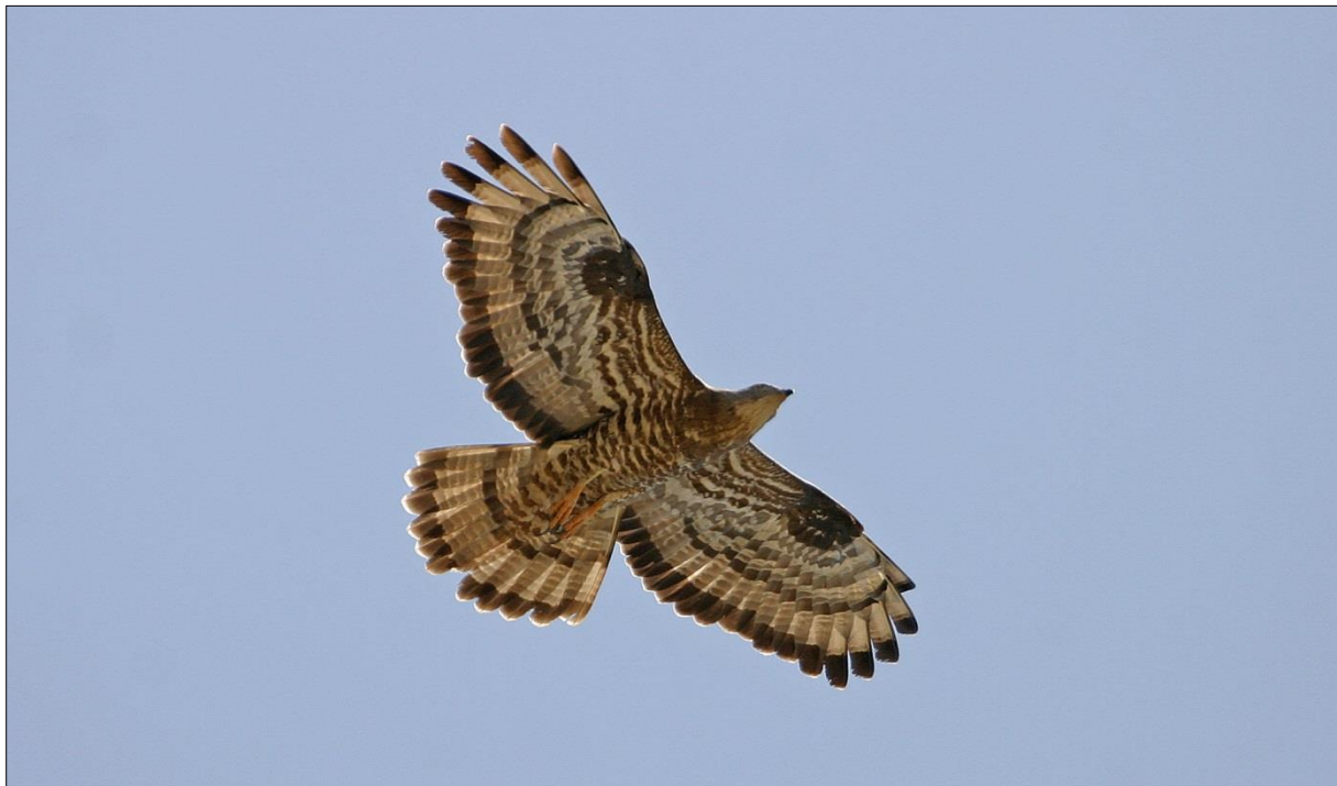
Honey buzzard on migration. More research is needed to establish a more accurate estimate of the population size for this red listed species in Norway.

Threats include deforestation, urbanisation and use of pesticides on the wintering grounds. A significant proportion of Fennoscandian honey buzzards are shot during their migration, especially in the Mediterranean area (Knoff et al. 2005). These problems are difficult to solve, but further mapping of migration routes and wintering areas, e. g. by the use of geolocators, transmitters or loggers, may provide the basis for further measures in this regard.