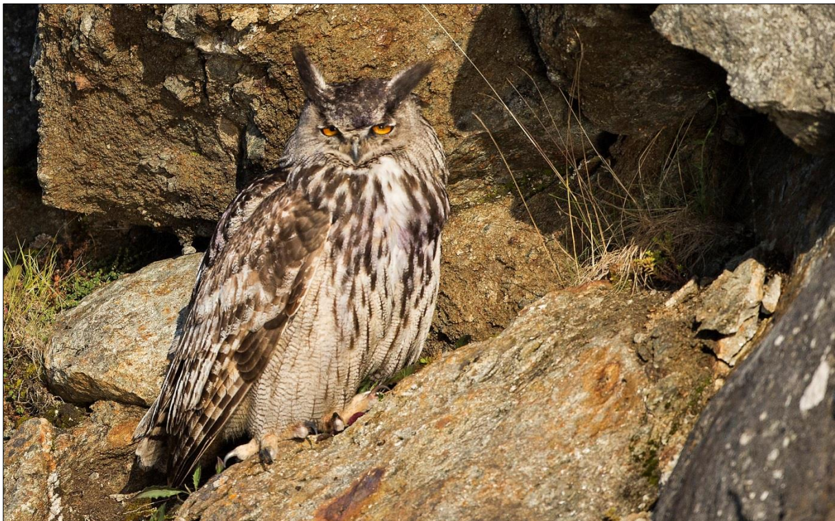
Eagle owl at nesting site in Lurøy, Nordland. The species has undergone serious population declines in Norway throughout the 20 th century, which is the reason why it is listed as “Endangered” on the most recent Norwegian Red List.