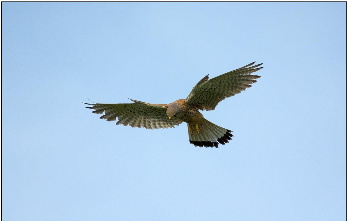
Male common kestrel. Efforts should be made to provide a better knowledge base of the population situation in Norway.

required if parent birds had provided only insects for an average brood size of 4.3 nestlings. The corresponding number of prey items was 3.4/hr for lizards, 1.9/hr for shrews, 0.83/hr for voles and 0.52/hr for birds. On the basis of this data, it is argued that boreal forest breeding kestrels would be unable to raise an average sized brood only on insects or lizards, and unlikely to do so only on shrews. In a peak vole year, however, kestrels would be able to raise an average size brood solely on voles (Steen et al. 2011b). These studies underline the need for sufficient numbers of birds and rodents in kestrel breeding areas. From the results of the nestbox project in Trysil, summarised in the monitoring section of this report, it is evident that number of available breeding sites was a limiting factor for the population size. Availability of nesting sites was, however, not a factor limiting population size in Lågendalen in Vestfold and Buskerud where another nestbox project has been initiated, and where there is a good population of crows which provide alternative sites in the form of used nests. The population in Lågendalen was larger in the period 1950-1960 than it is now. Landscape and agricultural changes are suggested reasons for the probable decline in Lågendalen (Steen 2013a).