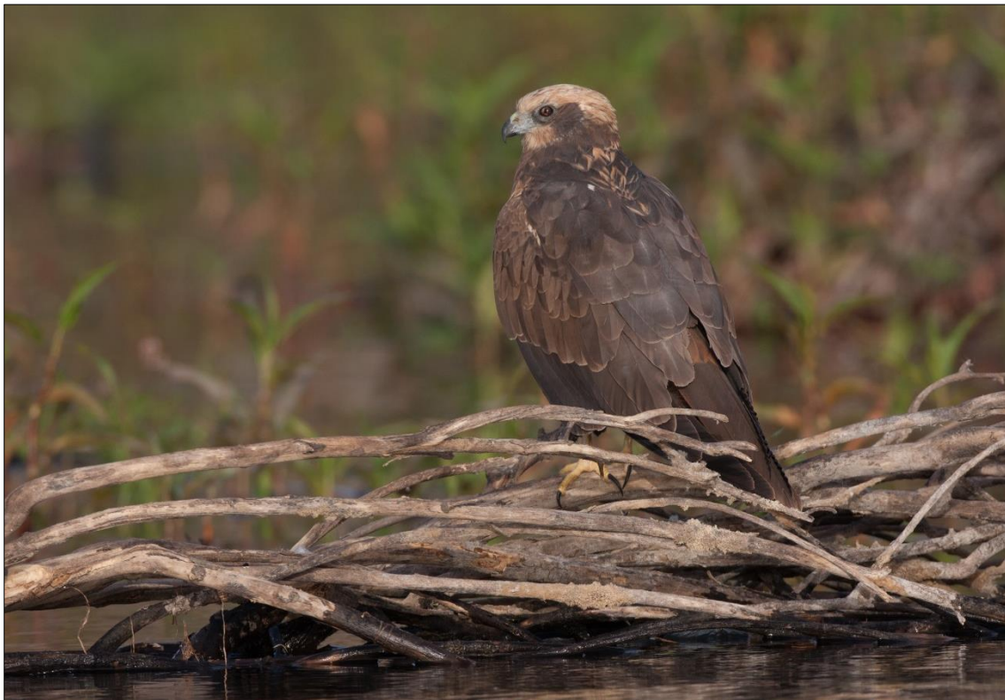
Juvenile Eurasian marsh harrier. The Norwegian population of this red listed species is rapidly growing.

As the Eurasian marsh harrier depends upon sedgy wetland areas and marshes as breeding locations, such areas should be protected. This habitat is not common in Norway compared to further south in Europe, and it is therefore important to protect the few areas that exist. As the study by Fernández & Azkona (1993) shows, Eurasian marsh harriers are vulnerable to even low levels of disturbance. It is therefore important to minimise or canalise outdoor activities (e. g. reduce boating, fishing and swimming) in their breeding habitats at critical periods of the year.