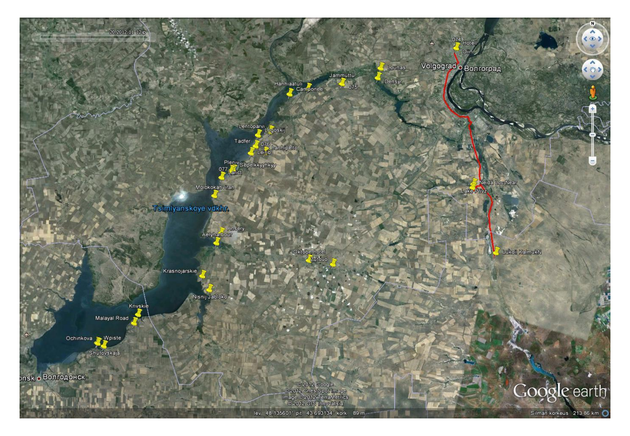
Figure 2. Map of the northern part of the surveyed area, with visited locations marked with yellow pins.