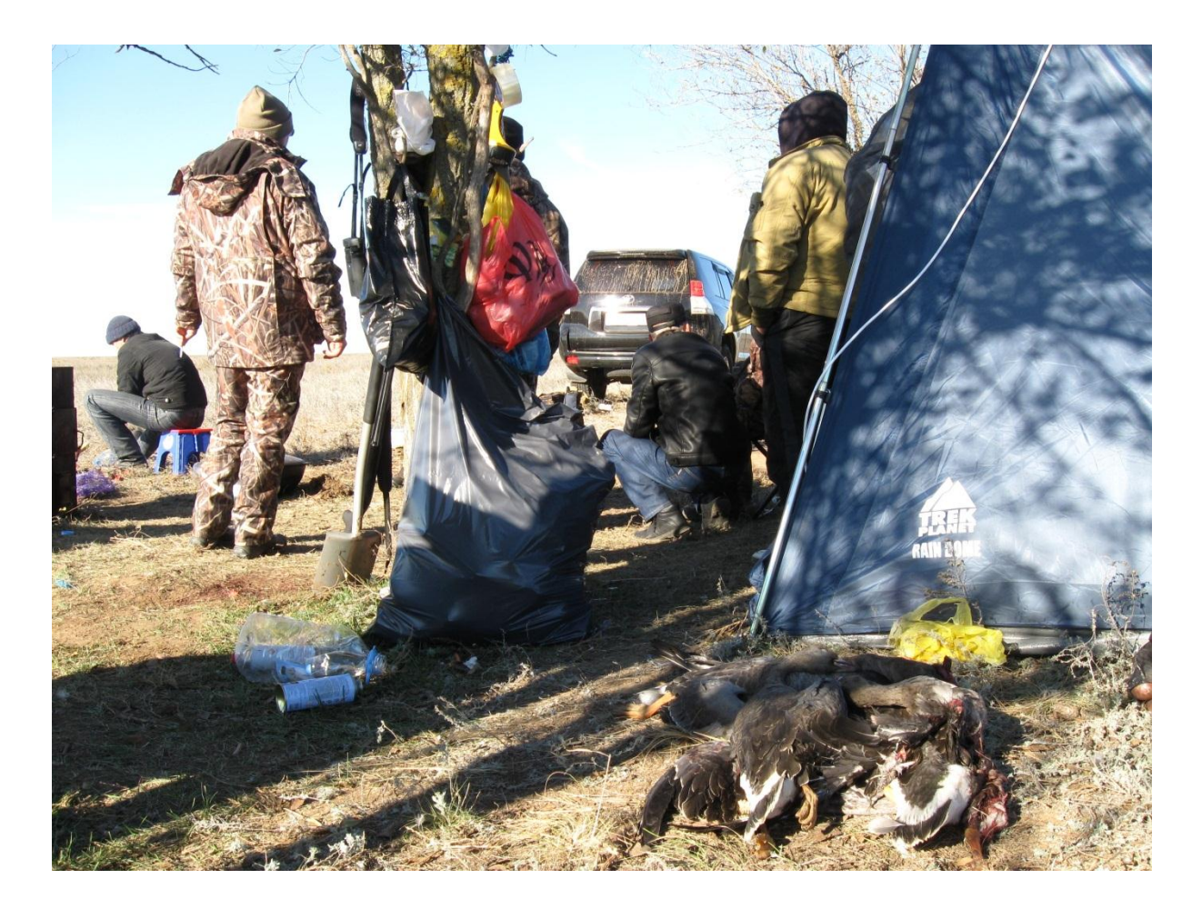
Photo 12. Hunters camp and hunting bag at fields near the Chogray Reservoir.

During the afternoon and evening of 11<sup>th</sup> we visited at the camp of hunters (our loc. Hunters N45,65420 E044,39279) and informed them about LWfG and checked their hunting bag: 5 Ansalb (4ad 1 1cy.). At the fields we saw four to five different hunting groups around the goose flocks. Some hunters use also plastic geese decoys to allure geese to the shooting zone. While evening flight after 17.15 we saw four hunters near the lake between villages Ferma and Zunda Tolga, and at least two geese were shot, and we heard three other shots.