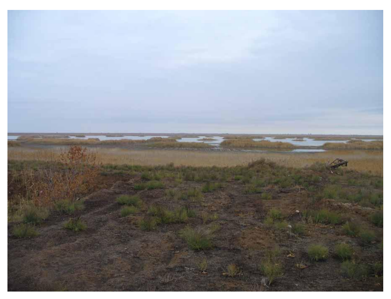
Photo 2. View to Lake Sarpa at location Sarpa Lakes Middle near the village Dubovyj Ovrag.

A. Sarpa-lakes system .The only hint (outside of LWfG GPS-locations from 2006) about existence of geese in the Volgograd Region was the Sarpa-lakes system. It is situated along the main road between Volgograd and Elista only 60 kilometres South from Volgograd. Old locations were situated more to the west and south from this lake system. We visited the area in the afternoon on 5<sup>th</sup> November. At the Lakes near Krasnoarmeisk, Volgograd there were open water with ducks but no geese (our location Sarpa Lakes N: 48,47273 N - 44,56465 E and Sarpa Lakes N2: 48,47388 N - 44,56447 E), shores and islands were with reed belts. Near the village Dubovyj Ovrag (our location Sarpa Lakes Middle 48,35625 N - 44,61438 E) we found some hundreds of geese drinking at open water. Local hunters told that most of the lakes are dried or suffering of dryness, the water level has been higher some two or three years ago, and in that time the amount of geese has been higher than at present.