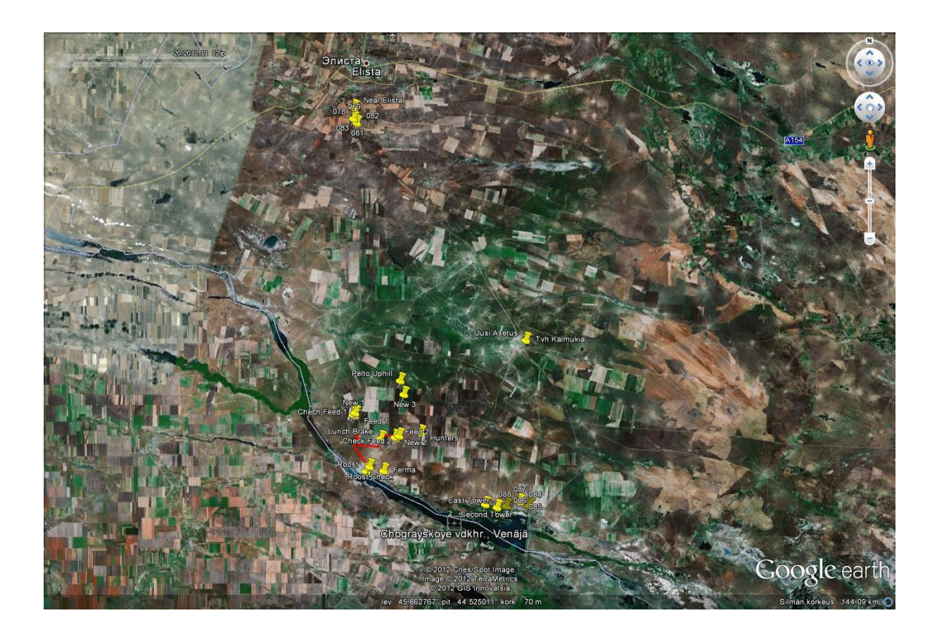
Figure 3. Map of the surveyed area in the south, with visited locations.

At 13<sup>th</sup> November in the morning: 68 at 07.40 in a mixed flock with Ansalb; c.25 Ansery N, on the shoreline until 10.45. 43 Ansery in the same area as on 12<sup>th</sup> November.