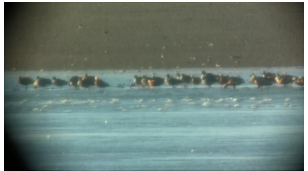
Photocapture 3. From digital video through telescope. LWfG and Ruddy Shelducks at the partly frozen shore of Chogray Reservoir. R. Karvonen