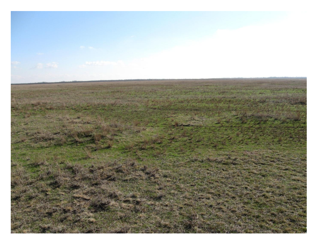
Photo 6. The area where LWfG Imre was located at 18<sup>th</sup> October 2006.

We drove along the east shoreline partly through small field roads and partly along the main road. Most of the areas were harvested field and minor parts of the field were sprouting up as green. The area where LWfG Imre was located at 18<sup>th</sup> October 2006 was visited at 8<sup>th</sup> November. It consisted of dry steppe and harvested fields and no geese were observed (our loc. Pleniv N48,29143 E043,20732).