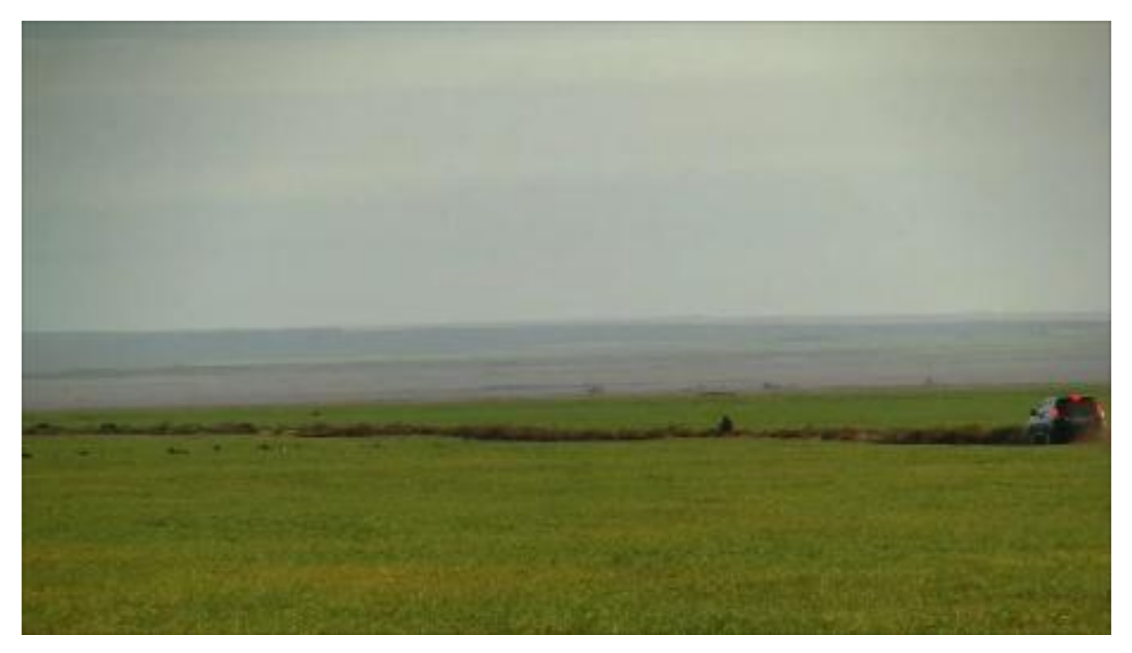
Photocapture 6. From digital video. Plastic geese lures, hided hunters and leader's car at Feed 2. at 11<sup>th</sup> November 2012. R.Karvonen

Photocapture 5. From digital video. A nervous geese flock flying over location Feed 2 at 11<sup>th</sup> November 2012. R.Karvonen