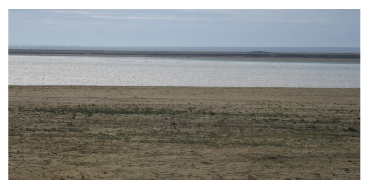
Photo 9. View to roosting site behind the Chogray Reservoir.

The location of the roosting site (Roost N45,58683- E044,25550)(as well the feeding sites), was revealed by satellite tracking and we observed that area from opposite shore (our loc. Roost Check N45,59535 E044,26373), with a good view to the area. At the point, the lake is rather narrow and with muddy shoreline. At the upper parts of the shore there was some kind of grass-bushy vegetation up to height of 15-30 centimetres.