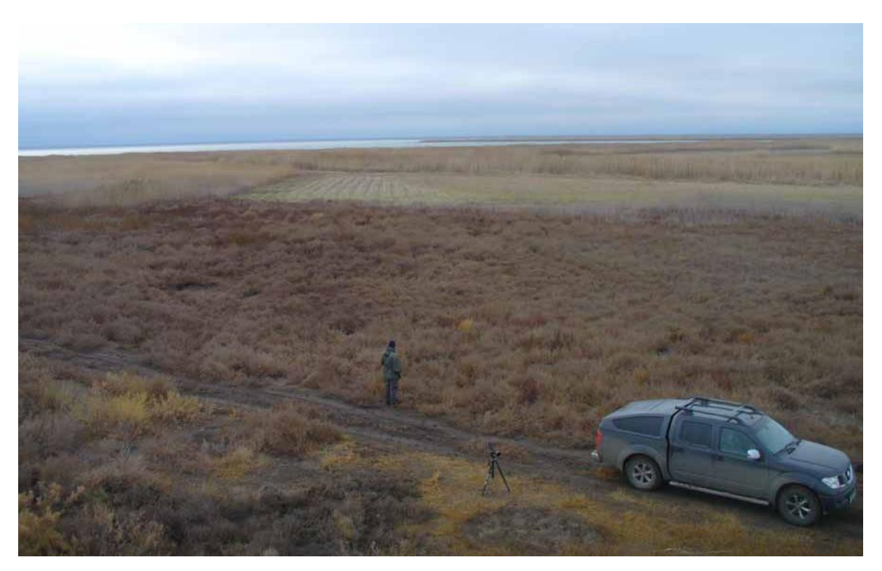
Photo 8. Risto Karvonen at Eastern part of Chogray Reservoir.