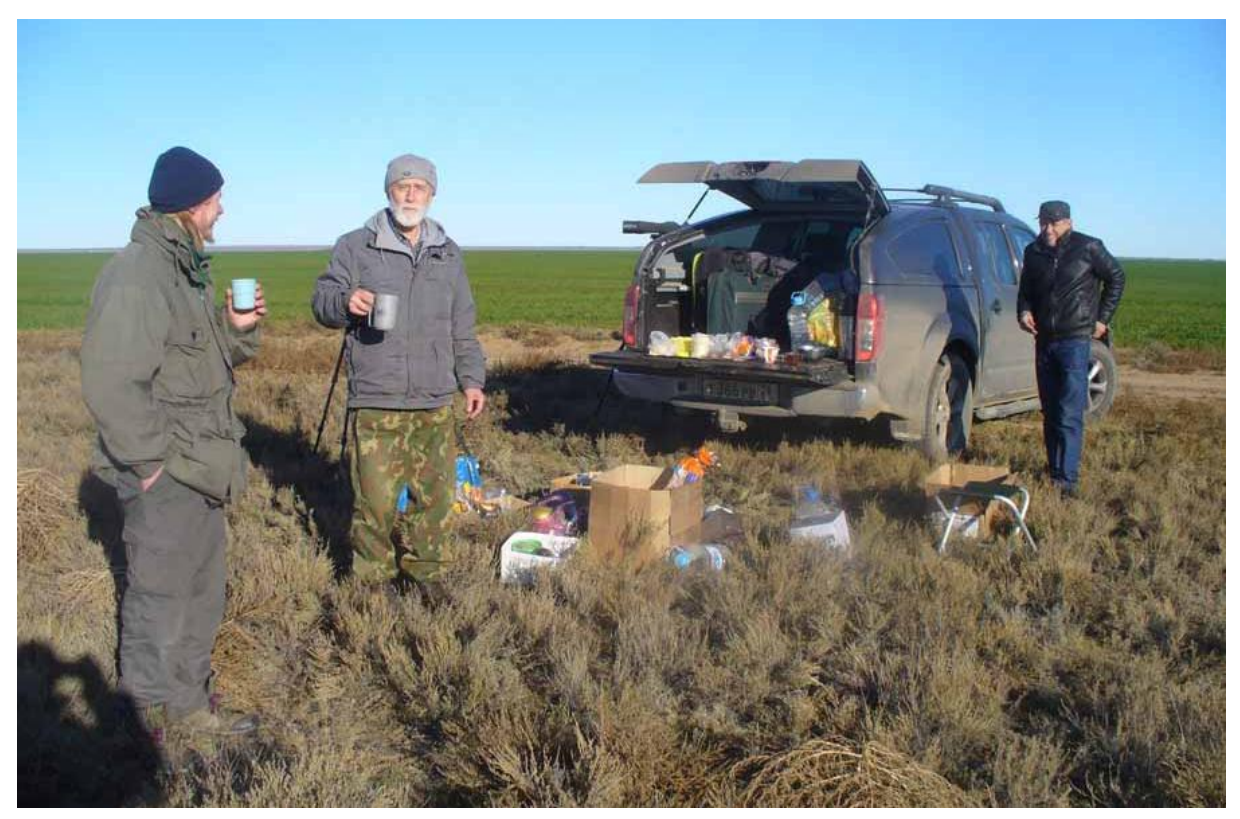
Photo 11. Coffee break at the edge of non-farmed steppe and sprouting field at location Feed 2.

The field of location feed 2 (Feed 2: N45,64365 - E044,32933) was still favourable to geese, it was also green with sprouting wheat. Geese grazed in the middle of the wolding field and hunters went around the field and hid near the edges.