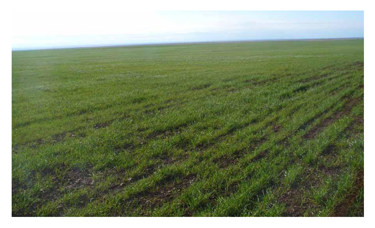
Photo 10. Sprouting wheat field at location Feed 1.

We checked the feeding area (Feed 1: N45,68450- E044,22750) at mid-day 12<sup>th</sup> November. The field (size 4x5 km) was green with sprouting wheat at height 12 to15 cm, but no geese were feeding there. On the next harvested field we saw a flock of 1050 Little Bustards.