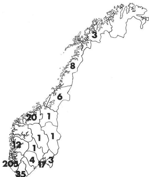
Fig. 1. The number of Yellow-browed Warblers recorded from each Norwegian county.

as belonging to P. i. humei . (2 ind. 06.11.1984 at Orre, co. Rogaland, Bentz 1986). The records are from most counties, except Finnmark, Sogn & Fjordane, Aust-Agder and Oslo & Akershus (Fig. 1).