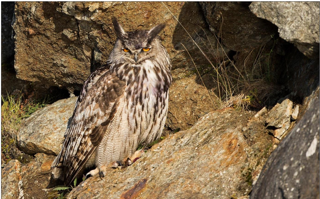
Eagle owl at nesting site in Lurøy, Nordland. The species has undergone serious population declines in Norway throughout the 20 th century, which is the reason why it is listed as “Endangered” on the most recent Norwegian Red List.